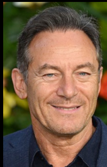
Jason Isaacs HARRY POTTER THE DEATH OF STALIN