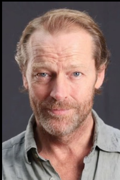
Iain Glen THE RIG GAME OF THRONES