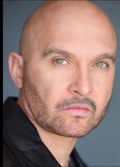
Dominique Vandenberg THE MERCENARY TRIPLE THREAT