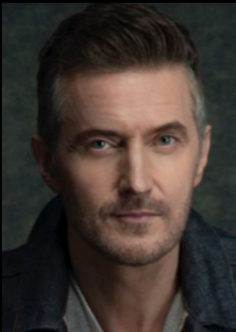
Richard Armitage THE HOBBIT OCEAN'S EIGHT